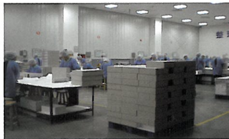
'Unique' box construction has produced with it some significant savings in the areas of storage and packing

The key feature of this collapsible box design is the way in which the sides fold over and tuck in on themselves.